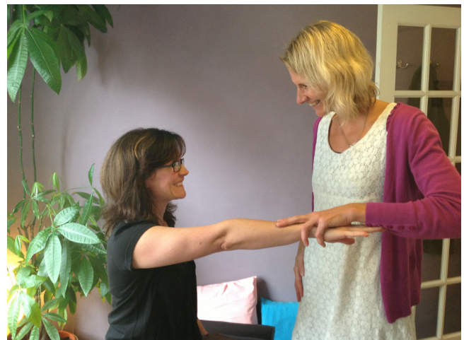
Fig. 1. Kinesiology-style manual muscle testing (kMMT): an example of one style.

During a kMMT, an external force is likewise applied to a muscle. At first, this practitioner-applied pressure causes an isometric then an eccentric contraction. More explicitly, during a kMMT, the patient holds a specific joint in a fixed position, usually in partial flexion. The practitioner then applies pressure, usually into extension, as the patient resists this pressure using an isometric contraction. For example, the practitioner may ask the patient to hold his shoulder (i.e. the glenohumeral joint) in 90° flexion, palm facing down, while he tests the anterior deltoid (see Fig. 1). Where the practitioner places his own hand for the application of the force into extension is often a matter of contention [10], but the location is routinely on the distal forearm of the patient, just proximal to the wrist joint, with the elbow held in full and locked extension (see Fig. 2). Some muscle testing practitioners disagree with this placement, as it contradicts Kendall's convention of testing one joint at a time [1], since pressure is being applied to both the shoulder and elbow joints simultaneously. The degree of shoulder flexion and abduction and elbow flexion may vary as well. Finally, while the degree of pressure that a practitioner applies can markedly differ, a steady